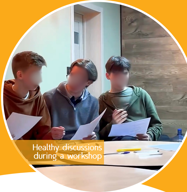
Healthy discussions during a workshop

It is incredibly difficult for us to raise funds for our undercover country partners, for obvious reasons. If you would like to support one of these projects, prayerfully or financially, please contact info@acet-uk.com to find out how to do so.