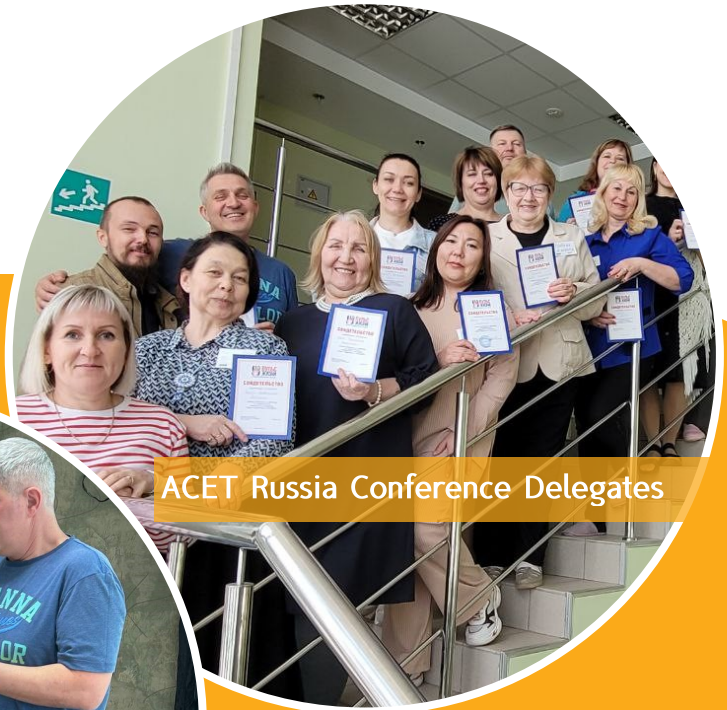
ACET Russia Conference Delegates

They had a special focus on birth, covering topics such as abortion, IVF, contraception, and surrogacy.