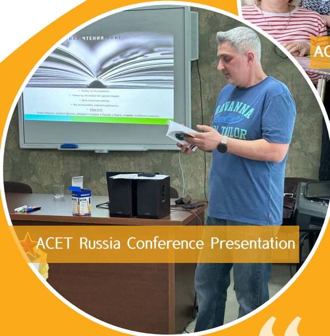
★ ACET Russia Conference Presentation