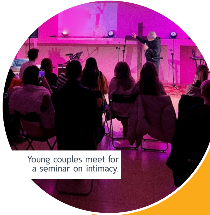
Young couples meet for a seminar on intimacy.

Meetings are held covertly, or in the open air, (at night) with the teams supporting students, parents and prisoners often on a weekly basis.